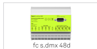
fc s.dmx 48d