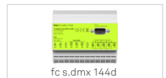
fc s.dmx 144d