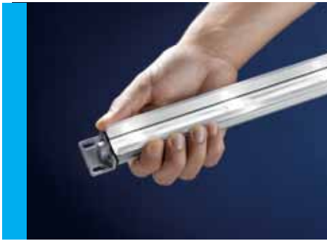
One linear system for all applications: LED module, lens and heat sink