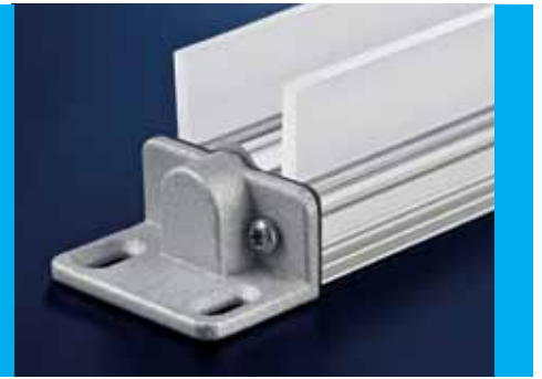
Simple mounting and installation thanks to robust end caps and IP66 protection